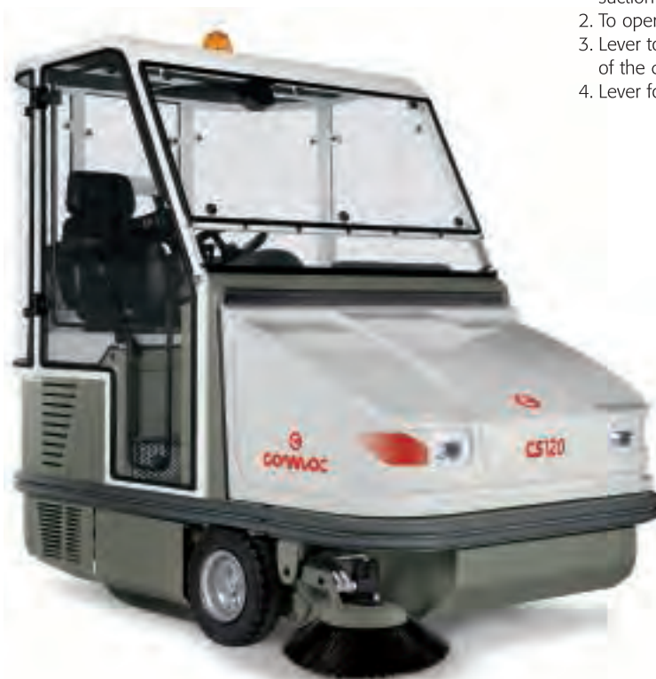
CS100/120 with cabin